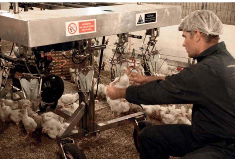
Image 1 - Five-week-old broiler grandparents on the AAT device

To simplify the process, a specialized device was developed over a period of 3 years by Agri Advanced Technologies (AAT), an EW GROUP subsidiary specializing in automation. This device saves time and labor by combining the vaccination and grading processes and birds only need to be handled once. It also contributes to higher precision during data collection. For this purpose, operations are partially automated and combined. The device weighs and grades the birds in up to three groups, and is equipped with 22 suspension cradles, in which the birds are supported at the base of their wings, ensuring comfortable handling of the birds with their heads in an upright position. Once applied onto the grading device, the birds can be vaccinated manually during the grading process.