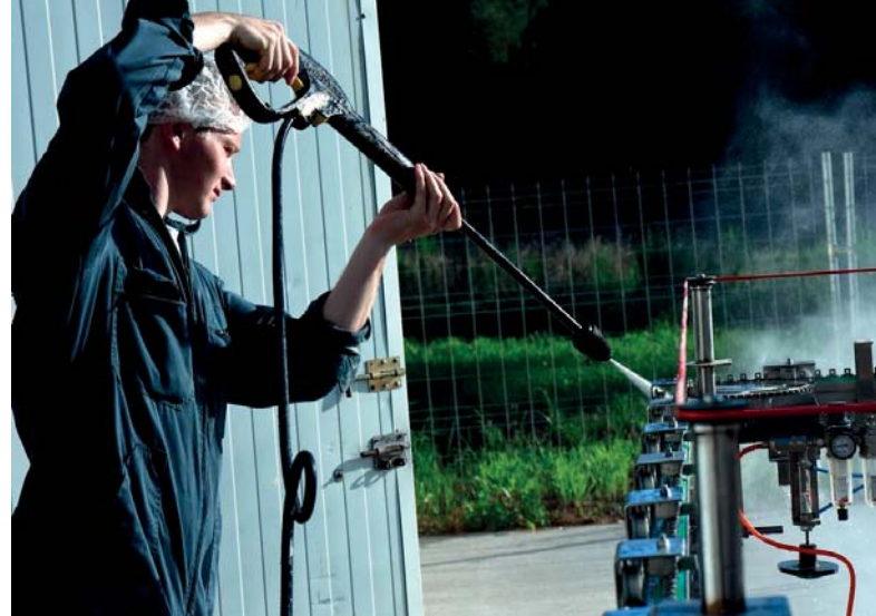
Image 4 - High pressure cleaning of the AAT device

Apart from the acquisition costs of the grading and vaccination device, knowing the hourly wage and possible number of gradings and vaccinations per device is crucial to determine the cost-effectiveness of automation.