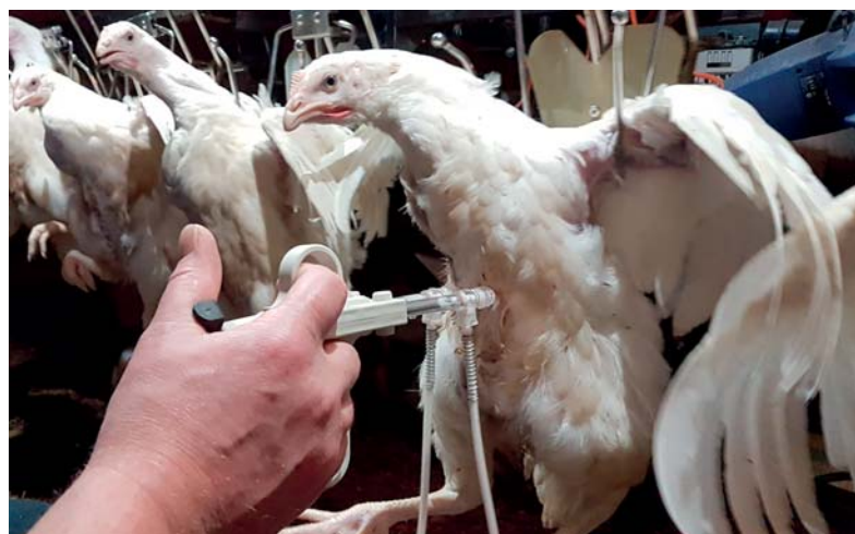
Image 3 - Chest vaccination of a bird on the AAT device

The device is operated and controlled via a touchscreen interface. The grading data is saved on a USB and can be transferred to a computer using evaluation software compatible with Microsoft Excel. In addition to the average flock weight, the coefficient of variation (CV), uniformity and weight of every bird are collected. In doing so, the uniformity of the entire flock can be reliably determined during grading, whereas without the device, securing uniformity is more or less based on random sampling of birds and visual assessments.